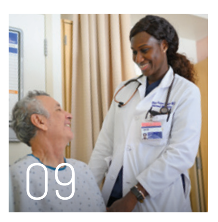
PLANNED GIVING Your Legacy Saves Lives Through Compassionate Care