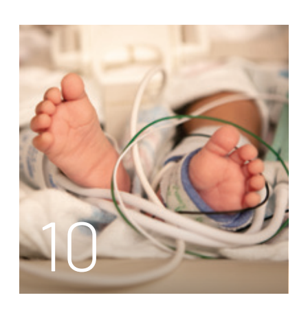
FUNDRAISING UPDATE Miracles Happen