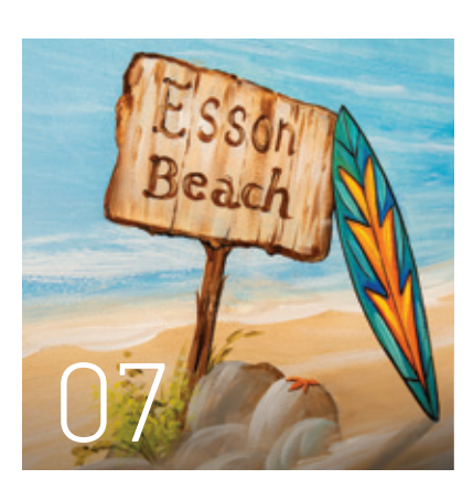
PLANNED GIVING Celebrating a Treasured Friend